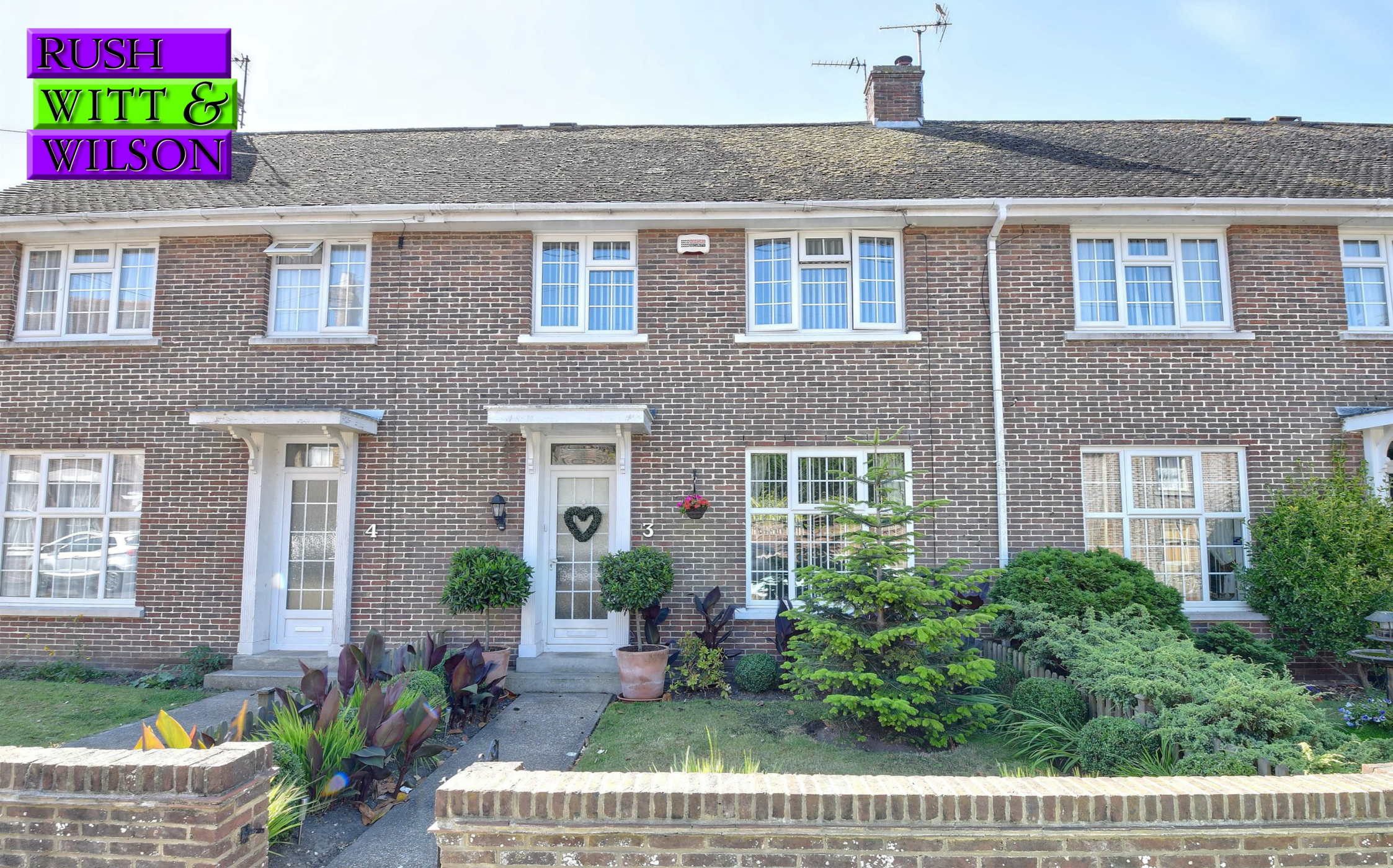
3 Rome House Corner North Street, New Romney, Kent TN28 8DL Guide Price £375,000